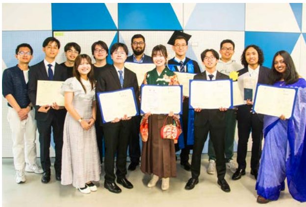
Graduates with juniors and alumni

March 26th marked a memorable milestone for the 6th batch of students, as they celebrated their achievement at the Graduation Ceremony. Surrounded by family, friends, juniors and faculty, the graduates walked across the stage to receive their diplomas, a testament to years of hard work and dedication.