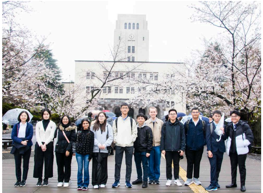
New students in front of the Main Building, Ookayama Campus

Congratulations to all the new students and welcome to an exciting journey ahead!